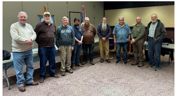
Photo below captured at March meeting