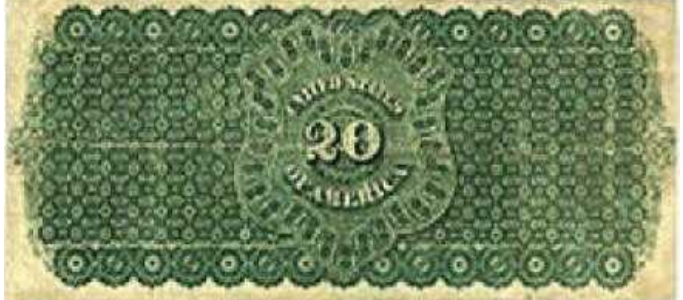
Union $20 Green Back

The costs entailed from four years of the civil war, was very expensive undertaking. When I speak of cost, I am not referring to the 750,000 lives lost of both-sides, nor the uncountable suffering of millions of persons from the traumatic loss of a loved one or the terrible loss of limb, sight, or psychological stability of the soldiers who though not killed, was wounded physically or mentally. Those kinds of losses would echo through the years and decades following the war. Indeed, we still feel subtle essence of the human loss all these years later, 153 vears after the fact. In this write up I will discuss the more mundane financial costs of the war, not because I lack compassion for those who died or suffered, but because the measure of dollars spent and the means of financing the war, is a more achievable task. Also, it is not something as commonly discussed, so perhaps some of you brothers might find the novelty of the subject of some interest to you.