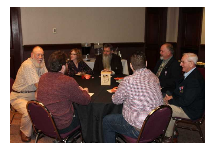
Round table 02