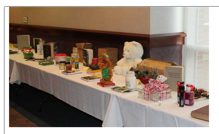
Many items on bingo table!