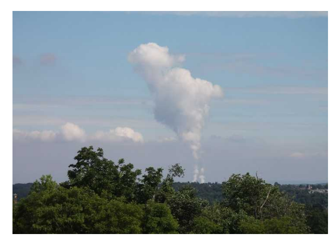
see TMI from afar!