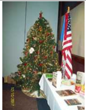
bingo table items!