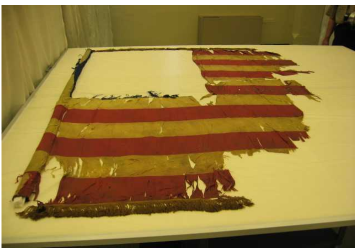
ANOTHER DAMAGED FLAG -NOT MUCH SURVIVED WAR!