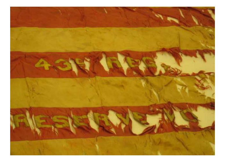
43<sup>rd</sup> Regimental Flag