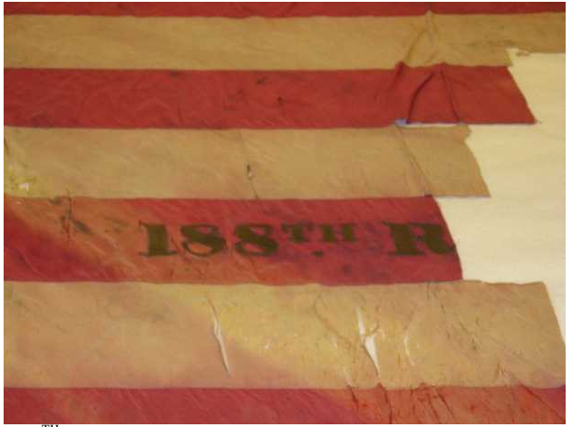
188<sup>TH</sup> REGT, PVI FLAG APPEARS TO HAVE BEEN VICTIM TO VETERANS GRASPING FOR A SOUVENIR