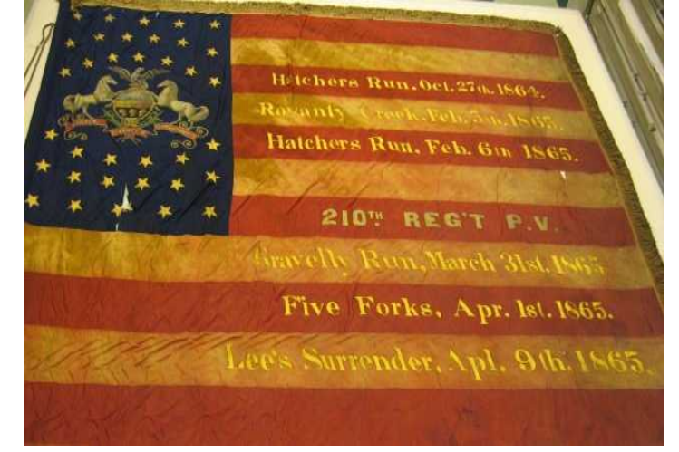
210^{\mbox{\tiny TH}} Regimental FLag