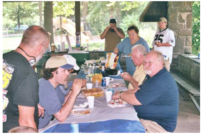
Let's see if the Hartranft Herald can name these folks for you:

Camp 15 gathers for annual summer time picnic