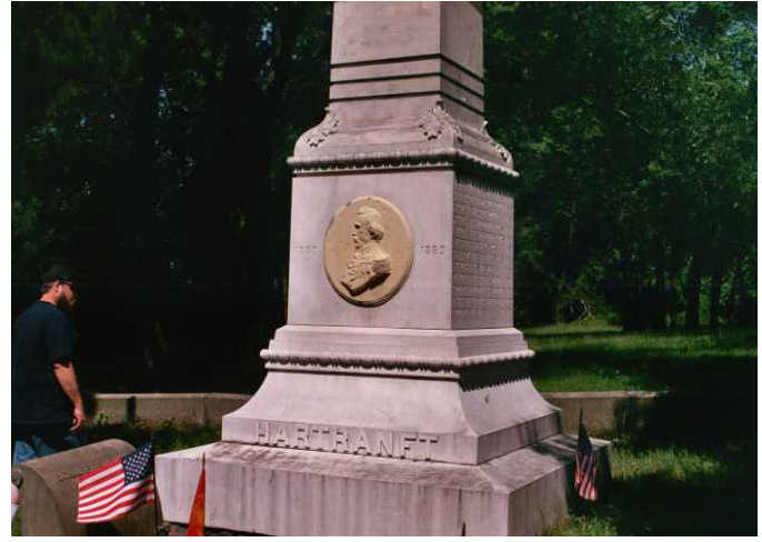
CLOSE UP OF HARTRANFT BUST

VIEW OF HARTRANFT'S 28<sup>TH</sup> DIVISION SYMBOL