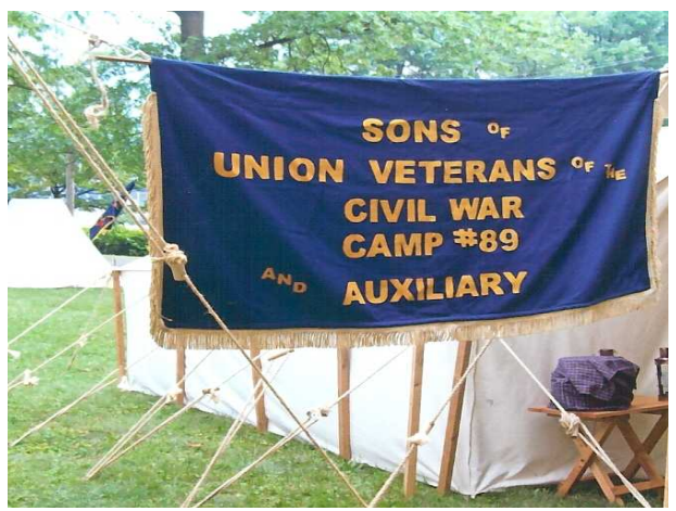
Crowther Camp 89 serving Tyrone, Blair Cty