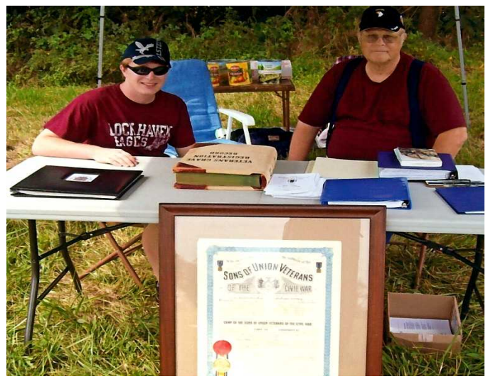
Seven Sheas Camp 7 city of Lebanon, Lebanon Cty

and living historians I have seen during my 2012 summer travels: