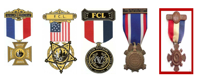
Come out to a meeting and join us! Allied Orders of the GAR