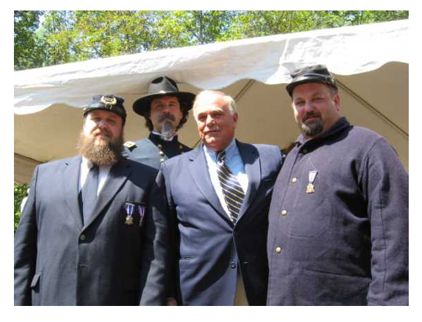
GOVERNOR & CAMP 15 OFFICERS ON HONORABLE DAY.