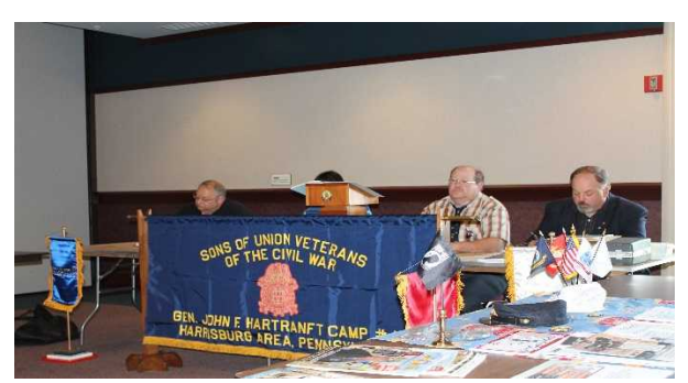
Camp officers preparing for ritual opening of September Camp meeting.