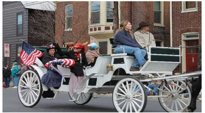
Sisters trying to stay warm upon open buggy