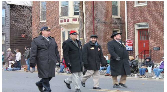
Headliners @Remembrance Day