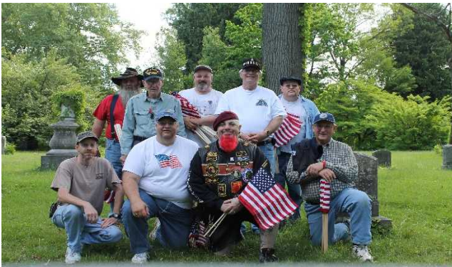
Yearly Honoring veterans at Harrisburg Cemetery