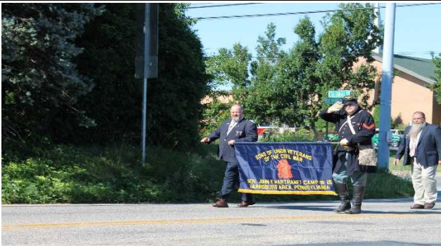
Parade for Heroes Grove LP Twp.