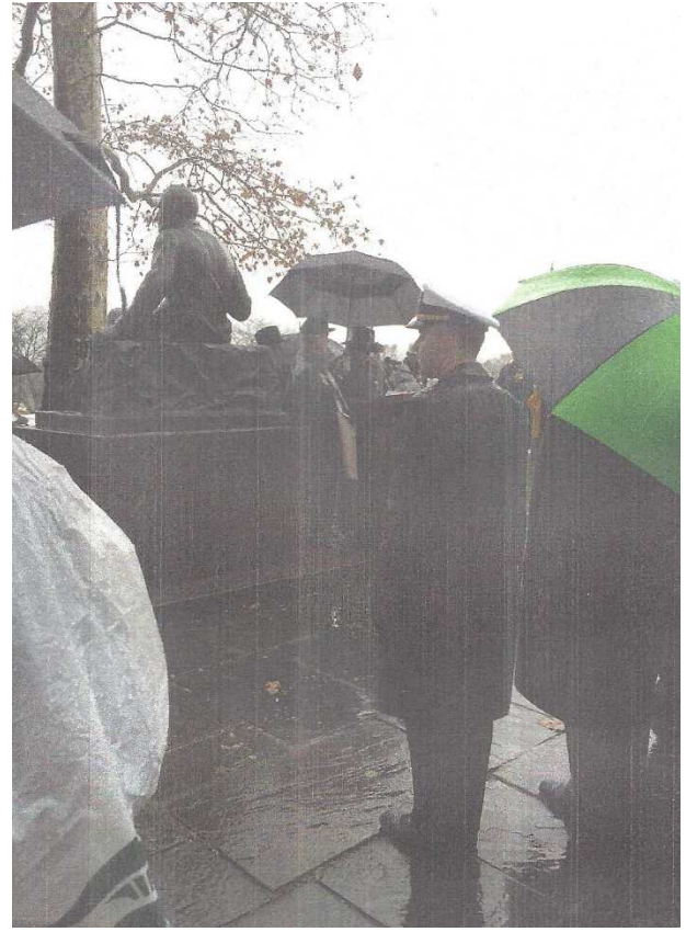
Wet soggy 2017 Remembrance Day at Gettysburg