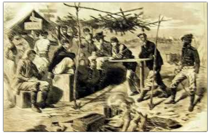
Circa 1862 civil war kitchen duty!