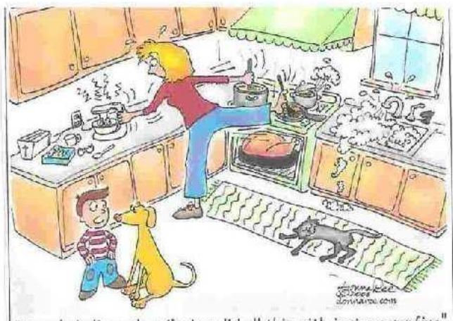
"I can't believe the pilgrims did all this with just a campfire." Modern day Thanksgiving Day kitchen duty!