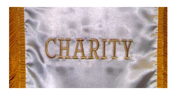
White, SVC Station Banner. Purchased from US Grant Camp 68.