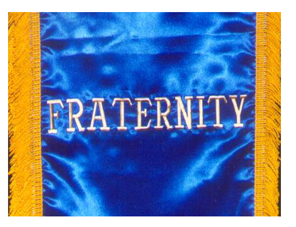
Blue , JVC Station Banner. Purchased from US Grant Camp 68.