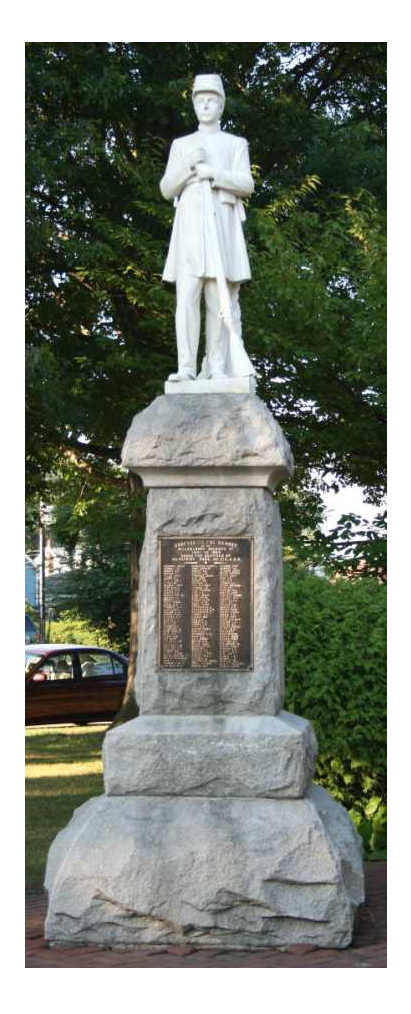
ERECTED TO THE MEMORY OF THE MILLERSBURG SOLDIERS OF 1861 TO 1865 UNDER THE AUSPICES OF KILPATRICK POST NO. 212, G. A. R.

The town of Millersburg in Dauphin County celebrated its 200<sup>th</sup> birthday this past summer. One of the town's prominent landmarks is the Civil War Monument that was dedicated on May 30, 1914. The six foot-tall, 900 pound soldier and his base were made from Italian marble. G.A.R. Post 212 and the Millersburg Sentinel raised $740 to pay for the monument, as well as the $55 required to ship it from Italy. The bronze plaque on its base bears the names of 126 Civil War veterans from Millersburg and vicinity. Maybe you're related to one or more of these brave men.