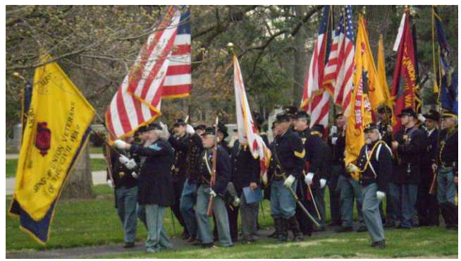
Marching onto the Lincoln Tomb while ducking below low hanging tree limbs. The command given: Dip those flags men and hang onto your Kepi!