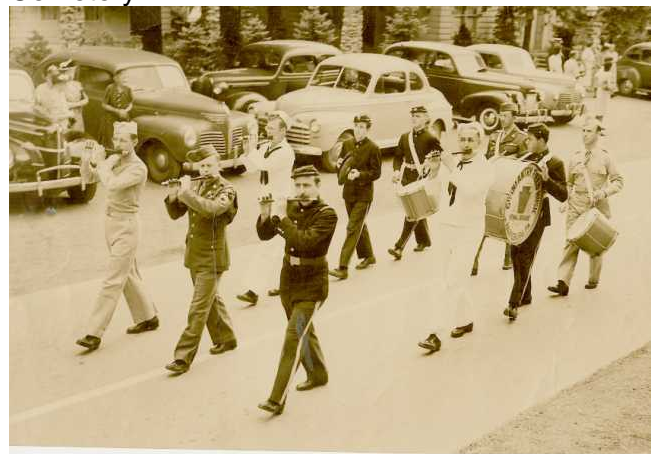
MEMORIAL DAY PARADE- 6th Inf Field Music SVR of Camp 15 marching to East Harrisburg Cemetery in the Penbrook Progress parade the Sunday before Memorial Day. 1945

**********From early morning until late afternoon the services and ceremonies continued and not a single grave was neglected with a tiny flag and blossoms.******Probably the most formal observation of the day was the grouping of the veterans for the march to the Harrisburg Cemetery.