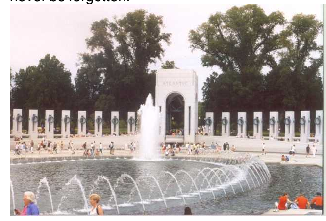
May 2009 Hartranft Herald -- Camp 15 Sons of Union Veterans of the Civil War

The memorial honors each state of the union and each theater of operation, the Atlantic and Pacific. We placed a wreath at the Pennsylvania tower (above). Though the 90 degree heat was a problem we all had an experience that can never be forgotten.