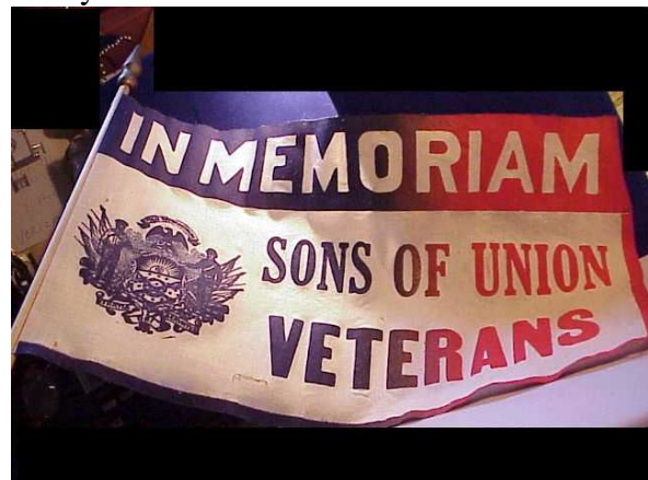
Old Sons of Union Veterans Banner prior to name change to Sons of Union Veterans of the Civil War!

Just as quickly, the weather cleared up; twas partly cloudy the remainder of the afternoon!