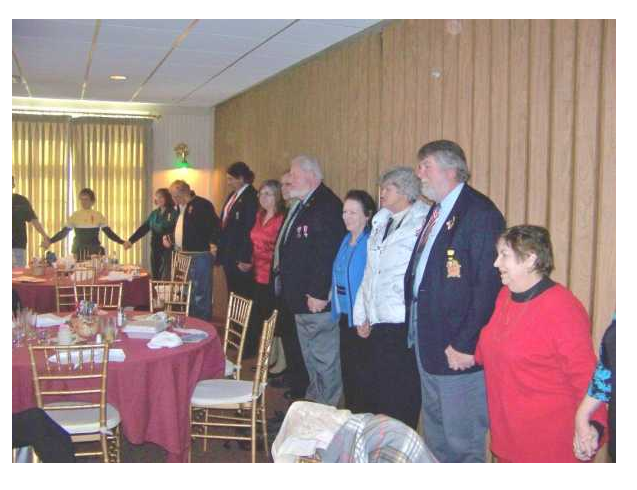
GUESTS ENGAGED IN TRADITIONAL "PENNSYLVANIA CLOSING".