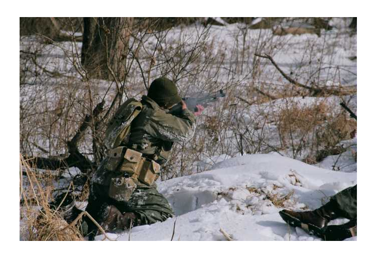
YOUNG GI REENACTOR, FROM CARLISLE, MANNING HEAVY BAR