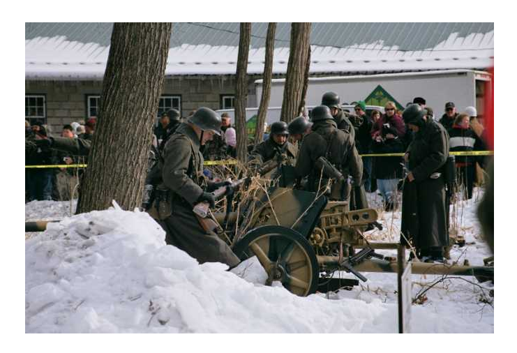
FORTIFIED GERMAN POSITION

Addition photos to be uploaded to Camp website in very near future.