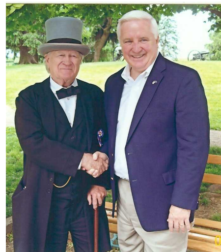
GOVERNOR CURTIN AND GOVERNOR CORBETT