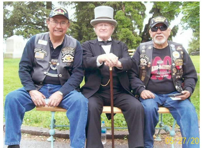
VETERAN BOOKENDS WITH GOVERNOR CURTIN AT GETTYSBURG ON MEMORIAL DAY