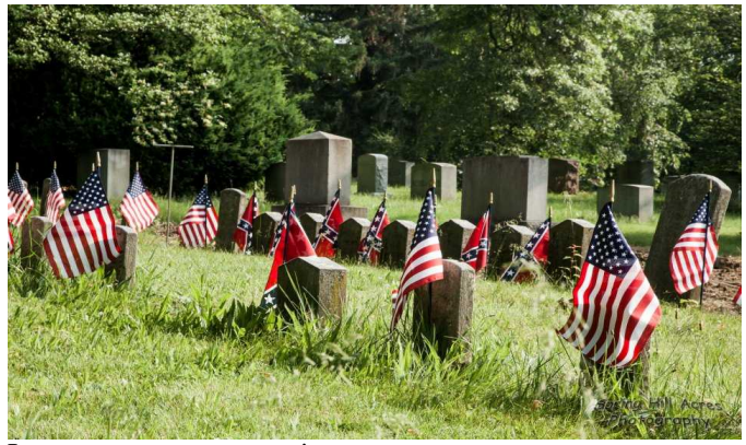
LET THE SUNSHINE ON!