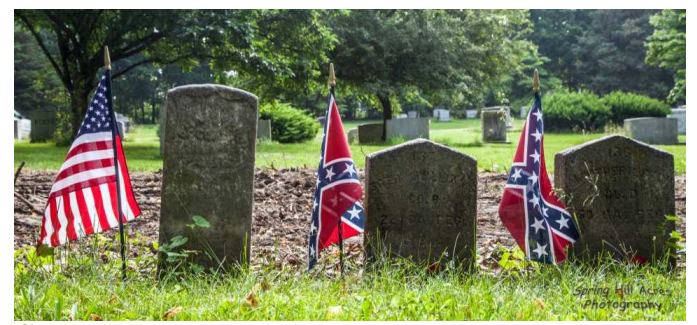
CAMP 15 AND LOCAL AMERICAN LEGION PAY TRIBUTE AT HISTORIC HARRISBURG CEMETERY MEMORIAL DAY WEEKEND 2012.