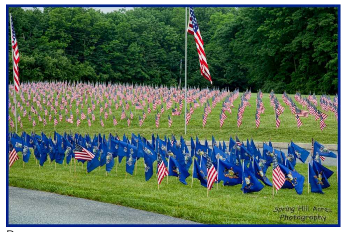
BLUE FLAGS IN FOREGROUND REPRESENT FALLEN PENNSYLVANIA VETERANS!