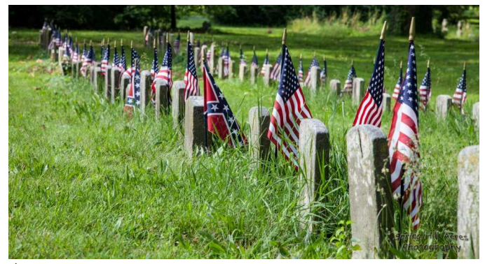
ANOTHER VIEW OF THE AREA.