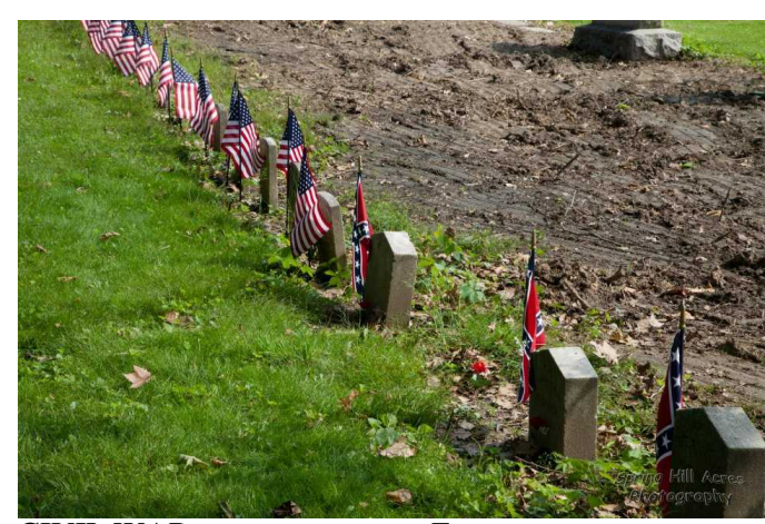
CIVIL WAR VETERANS PLOT. FORMER OLD HEDGEROW HAS BEEN REMOVED, TO NOT ONLY ALLOW SUN UPON THE CIVIL WAR VETERANS LAST RESTING PLACE, BUT TO ALLOW CONSTRUCTION BY AMERICAN LEGION, SPEARHEADED BY LES MCCLURE, TO INSTALL US FLAG AT THIS SIGHT.