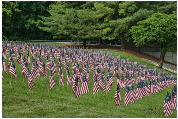
FLAGS ON DISPLAY AT FORT INDIANTOWN GAP NATIONAL CEMETERY MEMORIAL DAY 2012