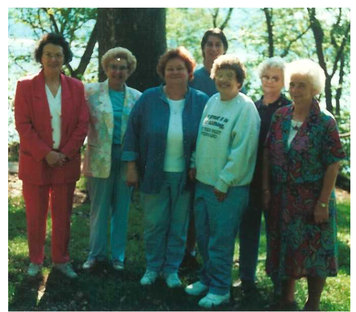
LADIES AND FRIENDS OF AUXILIARY 7 AT FORT HUNTER.

who was instrumental in revitalizing camp 15 during the late '90s!