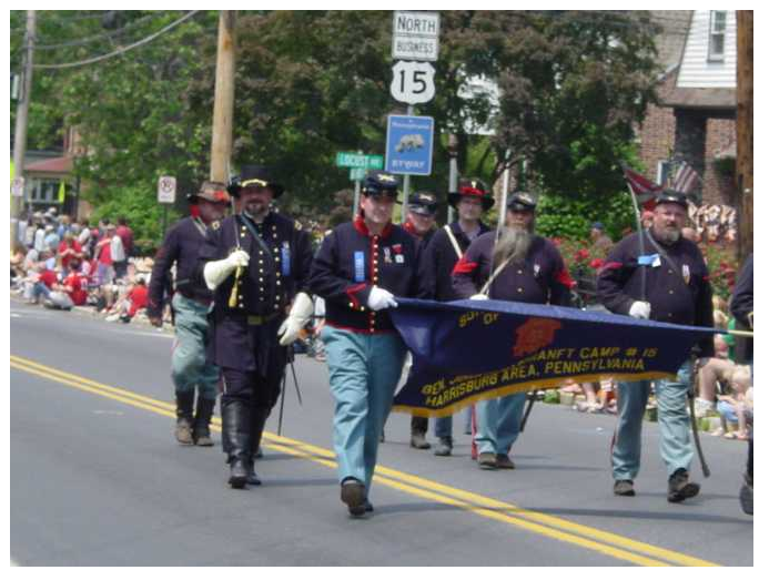
Camp 15 on the move during Windy Gettysburg Memorial Day parade 2010.