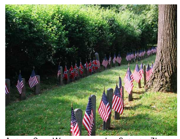
ABOVE, CIVIL WAR VETERANS' IN SECTION Z!