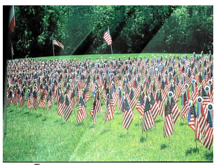
TRIBUTE TO FALLEN VETERANS OF THE IRAQ/AFGHANISTAN WARS, DISPLAYED ALONG ENTRANCE TO NATIONAL CEMETERY AT FORT INDIANTOWN GAP, PA. TALLER FLAGS ON DISPLAY THRU-OUT CEMETERY TO HONOR ALL VETERANS LAID TO REST AT THE GAP.