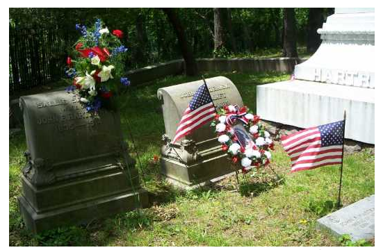
HARTRANFT FAMILY PLOT AT MONTGOMERY CEMETERY, NORRISTOWN PHOTOS SUBMITTED BY RON SHIREMAN.