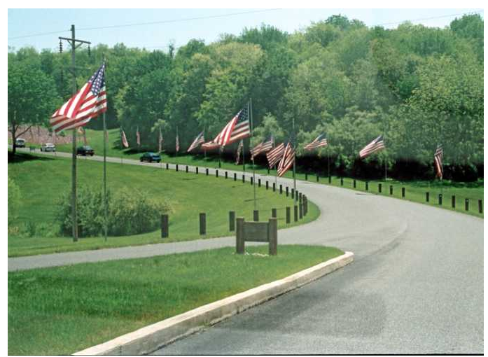
ENTRANCE TO NATIONAL VETERANS CEMETERY AT FORT INDIANTOWN GAP, ANNVILLE, PA NATIONAL MEMORIAL DAY, MAY 26, 2008.