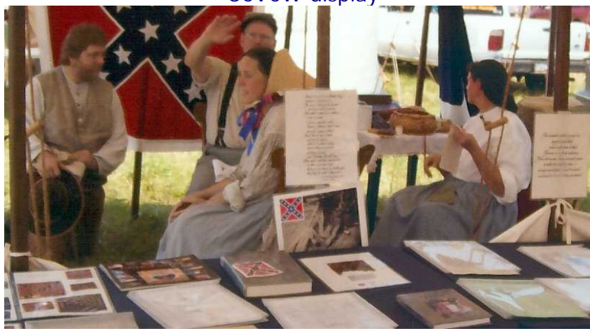
--- end ---