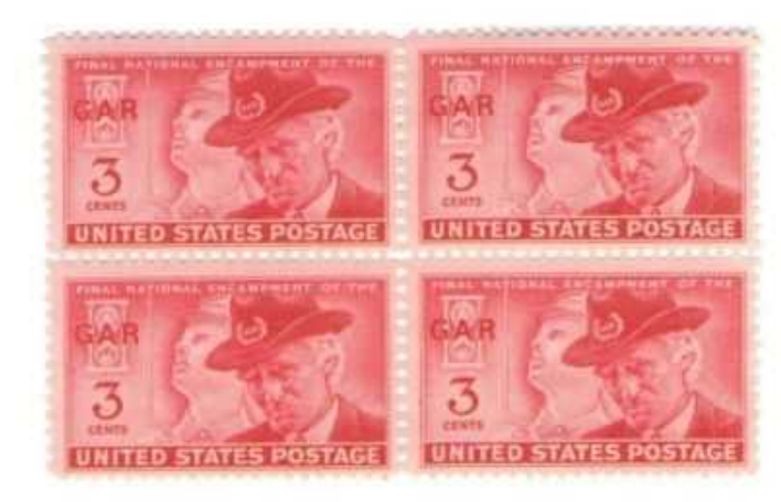
block of 1949 3-cent stamps in commemoration of the GAR Grand Army of the Republic