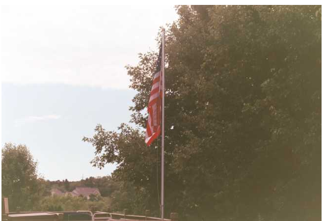
ONE OF THE FEW FLAGS ON DISPLAY MEMORIAL DAY! WHAT HAPPEN TO ALL OF THE FLAGS ON DISPLAY FOLLOWING 911 EVENTS?