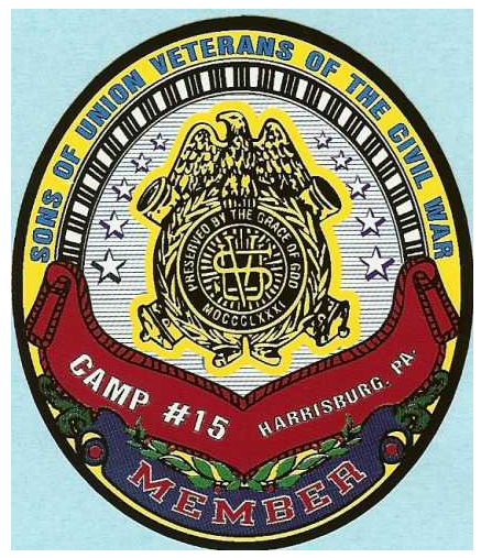
CAMP 15 MEMBERSHIP STICKER FOR VEHICLE OR NOTE BOOKS!

Jul 31 - Aug 01, 2010 10:00 AM - 04:00 PM