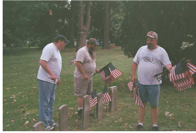
BROTHERS OF CAMP 15 AND COOPERS BATTERY READILY PRESENT FLAGS IN CIVIL WAR AREA.