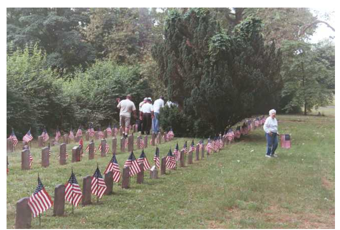
THE REASON FOR OUR MEMORIAL VISIT – CIVIL WAR PLOTS

Memorial Day Events at historic Harrisburg Cemetery at 13th and State streets.