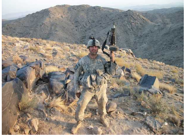
SOMEWHERE IN DIRTY, DUSTY AFGHANISTAN!

ponder almost daily what the life of a 'grunt' [EDITOR'S NOTE: foot soldier] must have been like in the past. I believe one thing remains constant, and that is this: Warfare is a relentless constant, an insatiable beast, and those who take part in it learn, at one juncture or another, that she is an untamable mistress. I am positive that our ancestors learnt this while fighting in the bloody conquest that was the War Between the States, and by remembering their sacrifices, we help our nation to understand the true meaning of freedom.