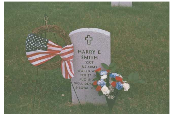
TRIBUTE TO VETERAN LAID TO REST AT INDIANTOWN GAP NATIONAL CEMETERY, ANNVILLE, PA. 2010

READERS MAY ENJOY PHOTOS OF CAMP 15'S MEMORIAL DAY EVENTS DISPLAYED IN PHOTO AREA AND NEWSLETTER AREA AT OUR CAMP WEBSITE AT WWW.SUVCWHarrisburgPA.org. MEMORIAL DAY PHOTOS HAVE GENERALLY BEEN AVAILABLE IN JUNE AND JULY ISSUES. CHECK EM OUT AT YOUR LEISURE DURING THESE LAZY HAZY DAYS OF 2010.