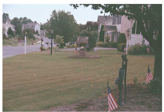
ONE OF THE FEW PATRIOTIC HOMES IN THE AREA!