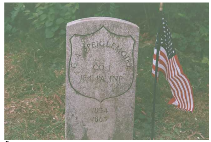
SPIGELMEYER ANCESTOR, FIRST TOMBSTONE AMONG CIVIL WAR VETERANS PLOTS