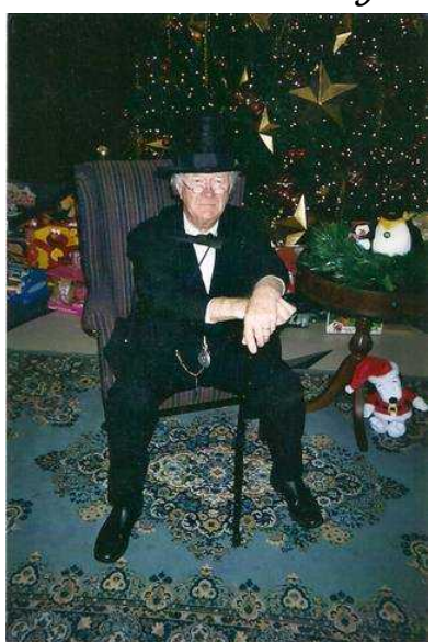
Camp 15 Dues time for year 2015