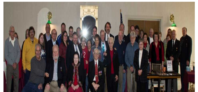
2011 GROUP PHOTO