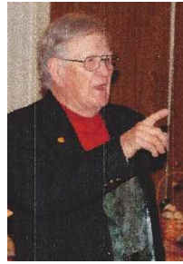
And another thing: Civil War Horse Soldier Artifacts Collection

One of our newest collections on Fold3 is The Civil War Horse Soldier Artifacts Collection . Like the title suggests, this collection contains images of Civil War artifacts from the Horse Solider antique store in Gettysburg, Pennsylvania. Visit www.Fold3.com for more info.