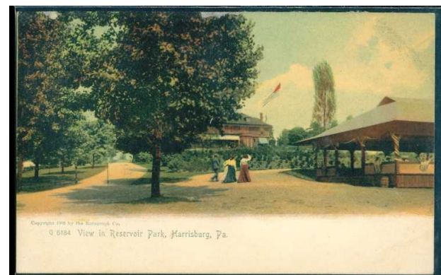
Original Pavilion about 1905 is shown below

It is the Park's Pavilion. Since it has no windows to be broken, I believe the park personnel attempt to board up the open spaces each winter to keep winter snows and freezing rain out of it to protect it to some degree!