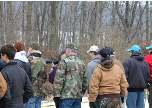
More cousins enjoying the balmy February weather.