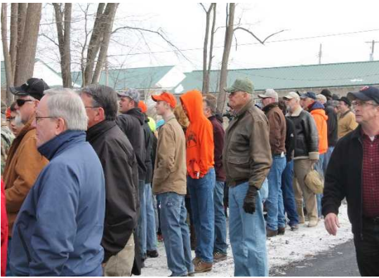
Portion of the crowd with cousin standing tall.