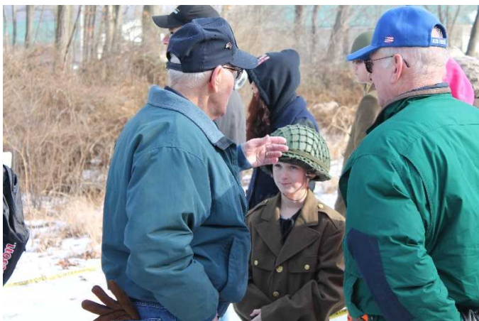
Youngster thrilled to speak with real World War II veteran.