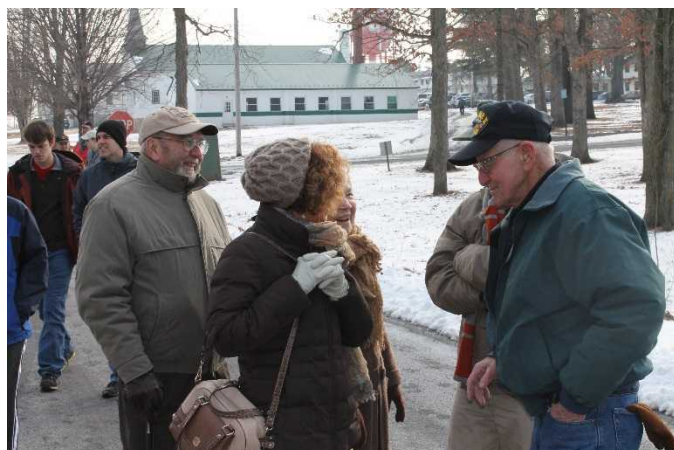
Visiting family ask many questions of the veterans on hand.