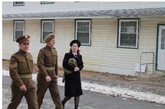
Variety of Reenactors! WWII era barracks in background with modern siding!