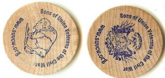
SUVCW wooden nickels

ID cards and wooden nickels free for the asking.