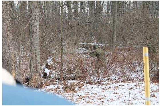
Typical scene of U.S. trooper on the move.