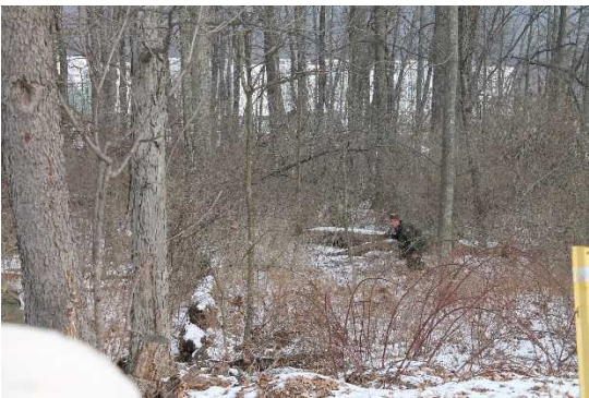
War correspondent following GI Joes into battle.