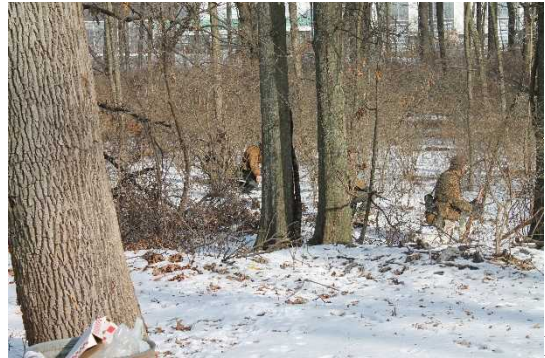
Plenty of ground cover for German forces.