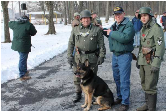
I capture you in the name of the post commander!