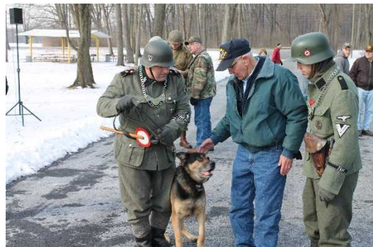
"Sprechen Sie Deutsch"

February 2014 Hartranft Herald Camp 15 Sons of Union Veterans of the Civil War Awarding winning newsletter -- Marshall A. Hope award presented to Hartranft Camp 2010-2011