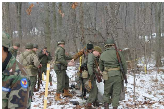
Allied forces prepping for skirmish with Axis troops.

Members of Camp 15 and 503 and cousins and friends took up multiple tables for breakfast prior to conveying to reenactment area at Ft. Indiantown Gap.