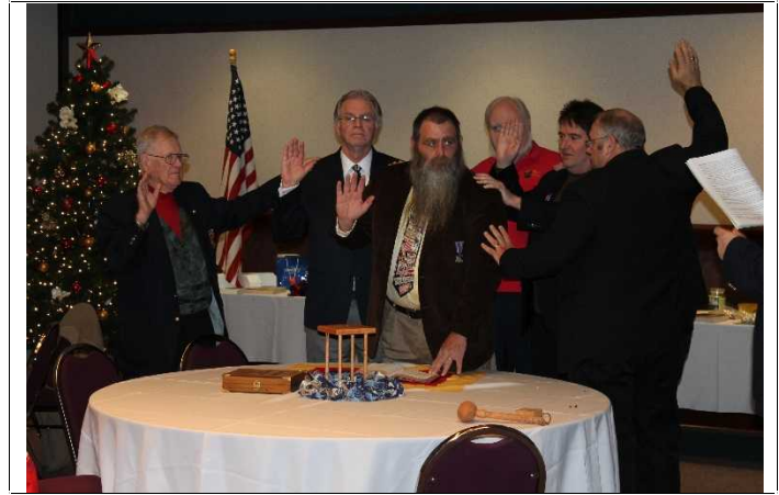
ELECTED CAMP OFFICERS BEING INSTALLED FOR 2014.