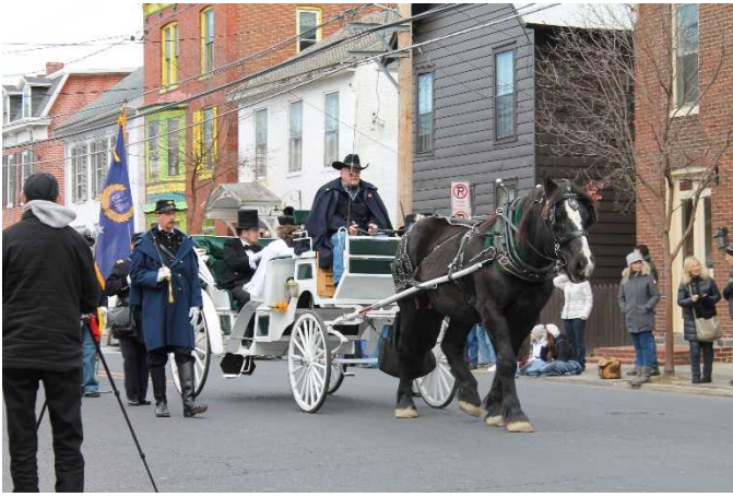
Abe Lincoln & Governor Curtin transportation.