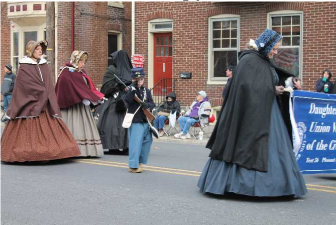
Future Department Commander saluting!