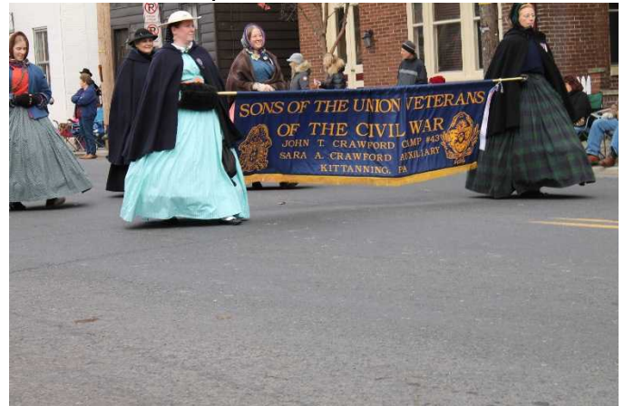
Sisters of Kittanning.