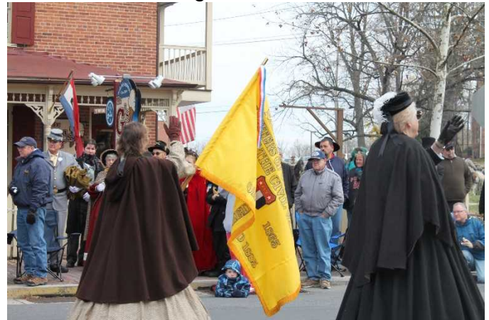
Who's that lady!

December 2013 Hartranft Herald Camp 15 Sons of Union Veterans of the Civil War