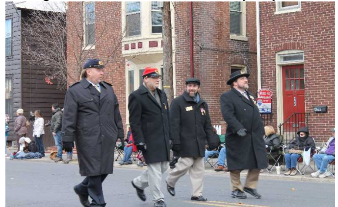
Commander in Chief and Staff r to l.