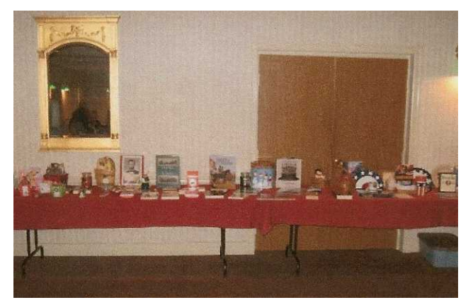
GIFT TABLE 2012!