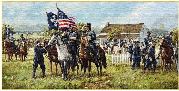
Expecting a Battle