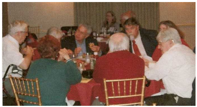
GRAND DISCUSSION AT THIS TABLE OF HAPPY PARTY GOERS!