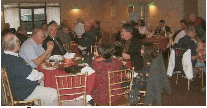
CAMP BROTHERS AND FAMILY ENJOYING TALK AND GOOD FOOD AROUND THE TABLE