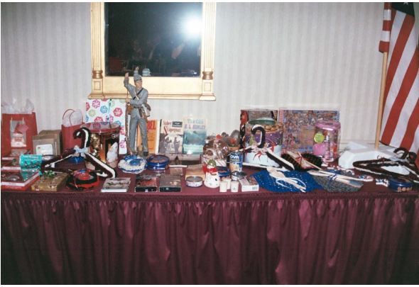
gift table 01