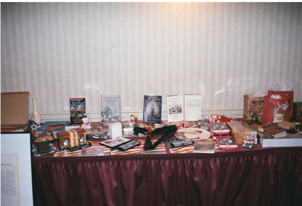
gift table 02