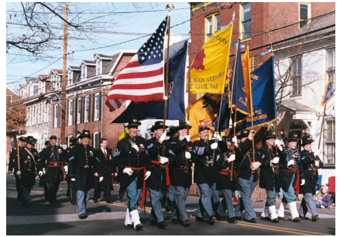
GETTYSBURG BLUES ON THE MARCH!