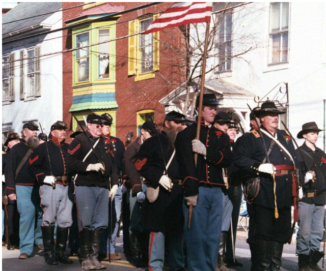
MEMBERS OF COOPER'S BATTERY AND/OR CAMP 503.