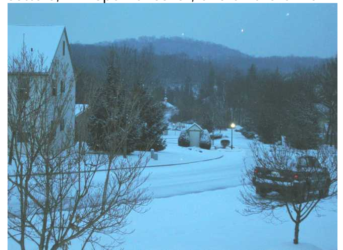
SCENE IS FROM A NEIGHBORHOOD IN HUMMELSTOWN, NEAR HERSHEY, PA.

Merry Christmas and Happy New Year to you and yours from the staff and management of Camp 15, Auxiliary 7, and your Hartranft Herald reporters, writers, graphic-artists, typesetters, Mr. Spell-Checker, and all the CPAs.