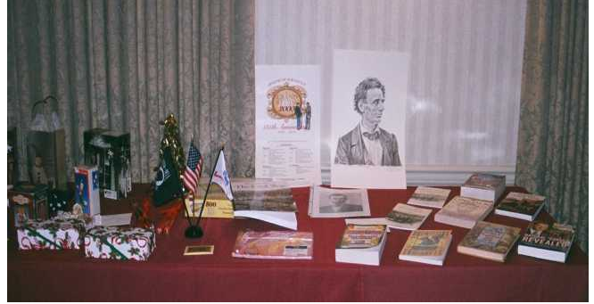
VARIETY OF ITEMS ON 1 OF 3 BINGO GIFT TABLES

In the freezing rain on Sunday December 13 at Doc Holliday's New Cumberland, we had: