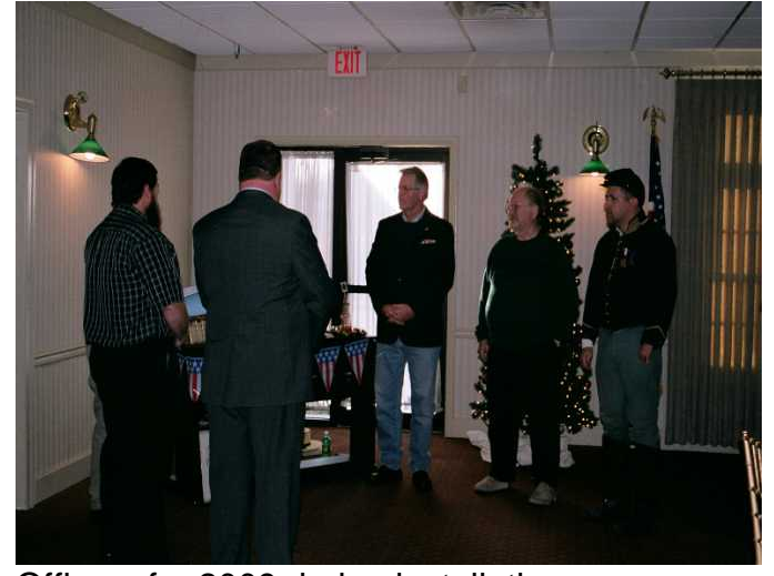
Officers for 2009 during installation.