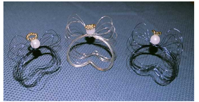
Once again, the blue out flanks the grey!

individual Civil War Johnny Reb and Billy Yank grey and blue respective place setting angels shown below: