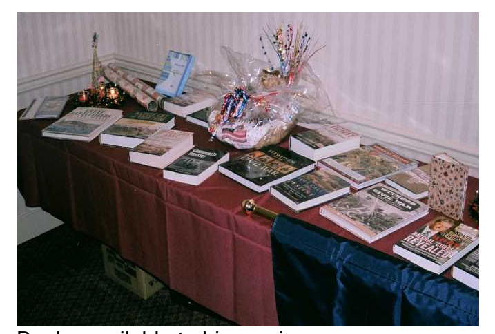
Books available to bingo winners.