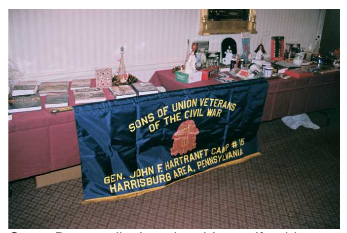
Camp Banner displayed on bingo gift table.