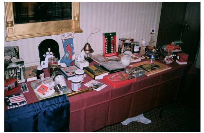
Additional bingo gifts for winners.