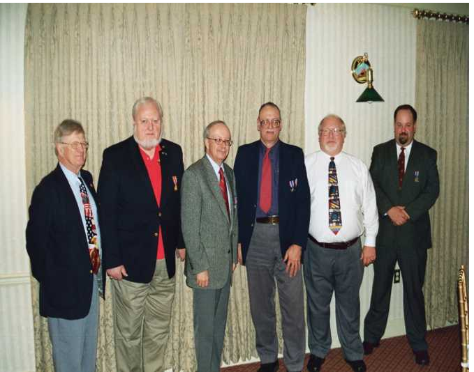
PAST CAMP 15 COMMANDERS PRESENT ALONG WITH COMMANDER-ELECT FOR 2008-09.