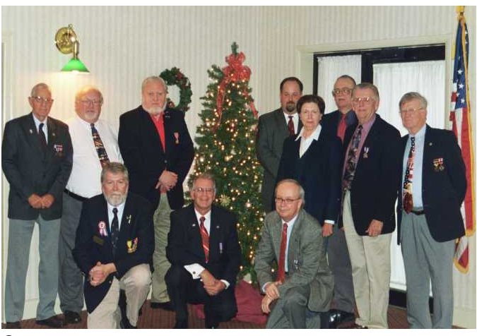
CAMP MEMBERS PRESENT TODAY.