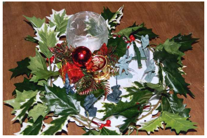
LOOKS LIKE THE BOYS IN BLUE ARE WINNING AGAIN.