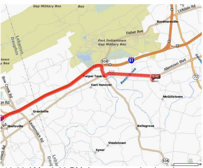
10:00 AM – 2:00 PM dress appropriately to keep warm – tis winter time at the Gap. Continued

10609 Allentown Blvd. Ono, PA 17077 Tel: 717-865-6517 Map posted here: