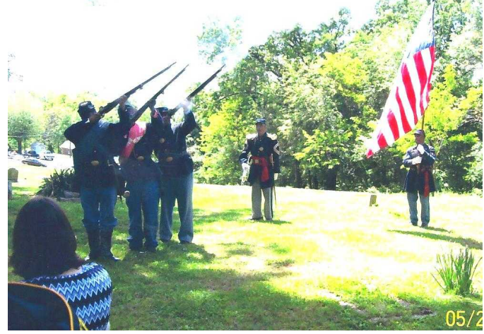
Memorial Day 2014 at Midland Colored Cemetery, Steelton, PA, 3d USCT color guard on duty from Philadelphia, PA

There are numerous 150th anniversary dates coming up in the fall. Check 1864 Dateline on your computer. --- DJK