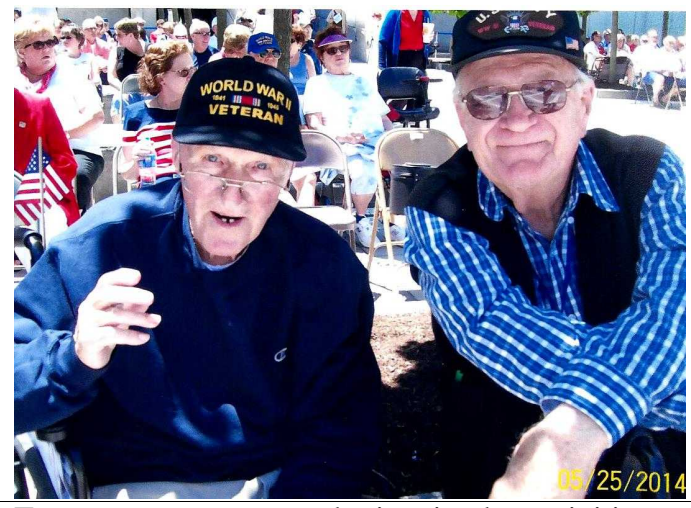
Two mature veterans sharing in the activities at Indiantown Gap National Cemetery's annual ceremonies for Memory Day, near Annville, PA.