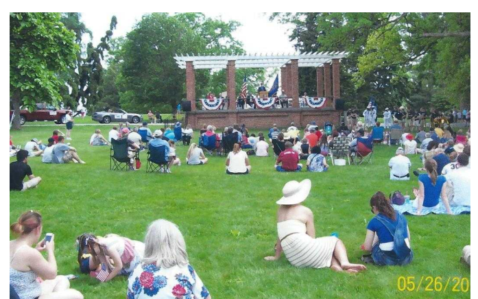
National Cemetery at Gettysburg, PA