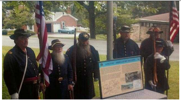
HONOR GUARD FOR UNVEILING OF A CIVIL WAR MARKER TO BE PLACED IN LEMOYNE, PA NEAR NEGLEY PARK – THE HONOR GUARD ARE MEMBERS OF 1ST PA LIGHT ARTILLERY, COOPER'S BATTERY B.

INDIVIDUALS AWARDED ACKNOWLEDGMENT FOR 50 YEARS OF SERVICE TO THE CIVIL WAR COMMUNITY AS RE-ENACTORS – LIVING HISTORIANS!