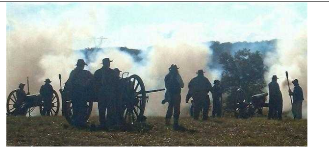
FIRING MISSION, 1ST PA LIGHT ARTILLERY, COOPER'S BATTERY B, AND CELEBRATION OF 150^{\text{TH}} CIVIL WAR events at Gettysburg 2013.