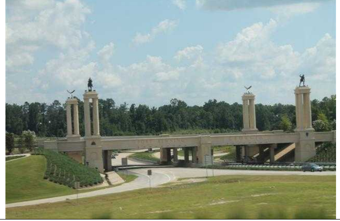
HIGHWAY EXIT TO FORT BENNING, COLUMBUS, GEORGIA

Please submit your visit, story, photos, and text to Hartranft Herald . Or perhaps you have an old story from an old Banner, Times, Post, Glamour, Live and Life , you would like to share!