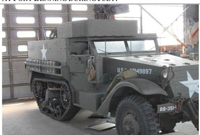
WWII HALF-TRACK, AT ARMOR MUSEUM, WAITING TO BE REFURBISHED ALONG WITH MANY OTHER VEHICLES.