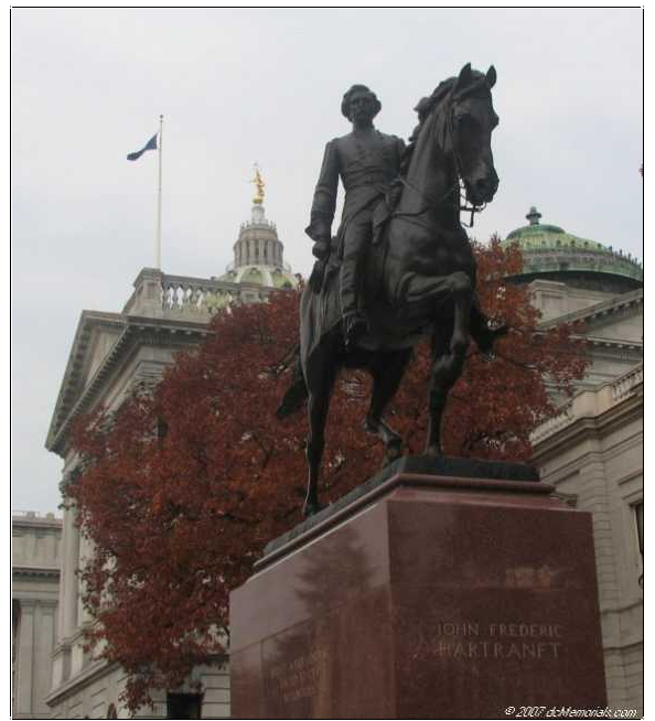
MODERN VIEW OF RELOCATED MONUMENT.

1905 POST CARD VIEW OF MONUMENT LOCATED ON GROUNDS OF THE CAPITOL COMPLEX ALONG 3^{RD} Street downtown Harrisburg.