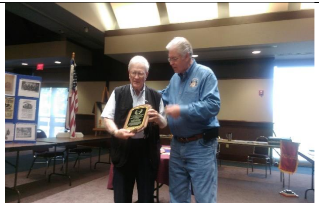
Congratulations to a most deserving brother of our grand brotherhood of the Sons of Union Veterans of the Civil War and the central Pennsylvania Civil War Community.