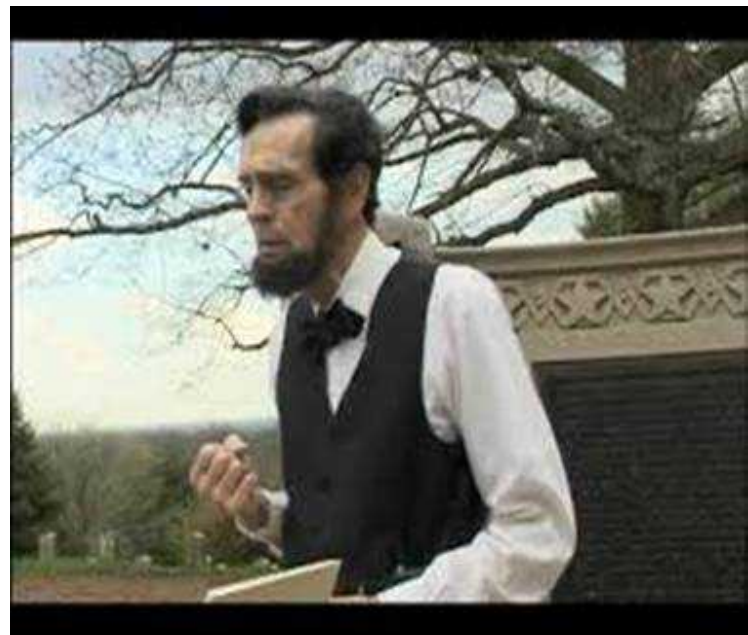
President Lincoln, Gettysburg, November 19, 1863.

I hope to see many of you in the upcoming events cited above. And now for your perusal, I have included a special illustrations below, related to Remembrance Day and the Gettysburg Address.