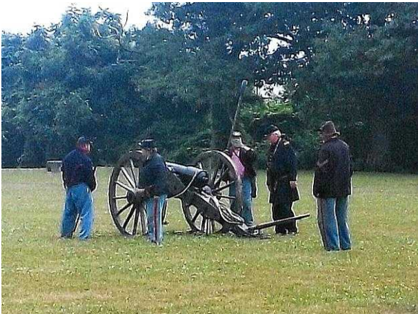
Copper's Battery B featuring some Brothers of Camp 15

Civil War Days in Harrisburg, Father's Day weekend 2017, and Camp 15 was on duty at free community day at National Civil War Museum.