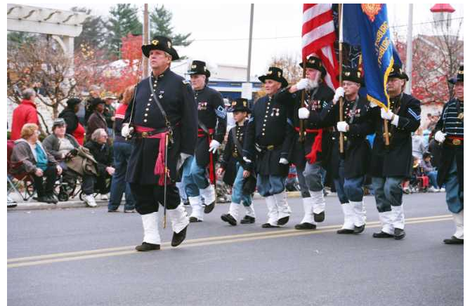
CAMP 112'S GETTYSBURG'S BLUES LIVELY STEPPING ALONG!