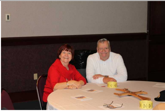
The Drumm Family