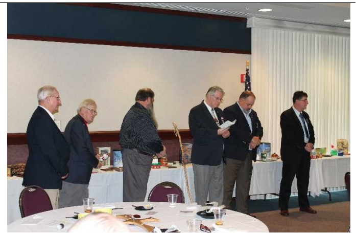
Brothers prepared for installaton for new year!