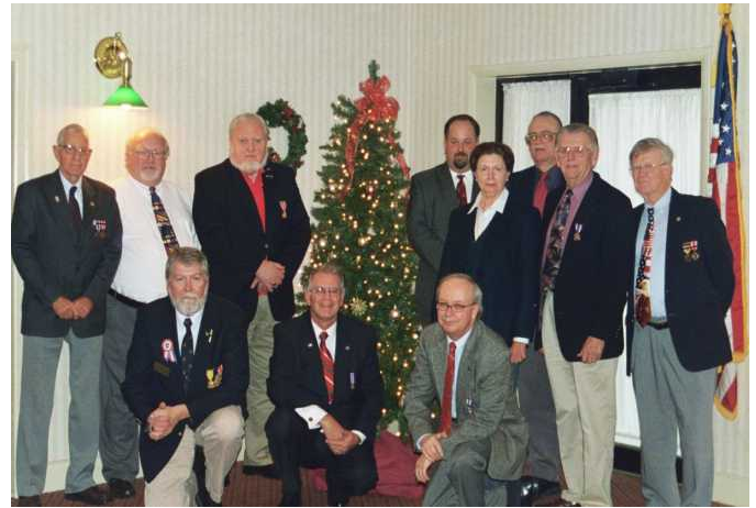
CAMP MEMBERS PRESENT TODAY.