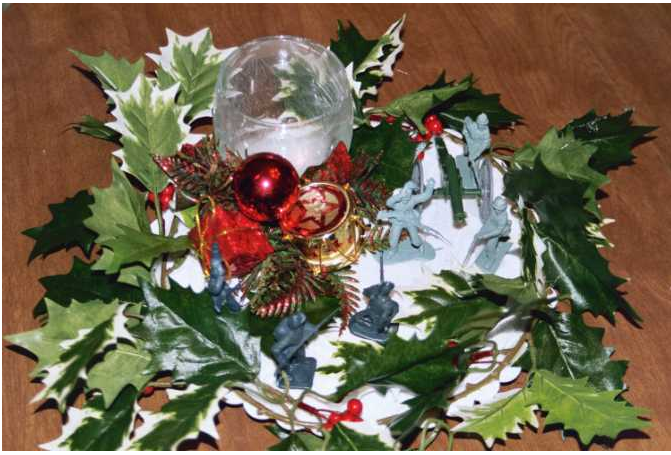
LOOKS LIKE THE BOYS IN BLUE ARE WINNING AGAIN.