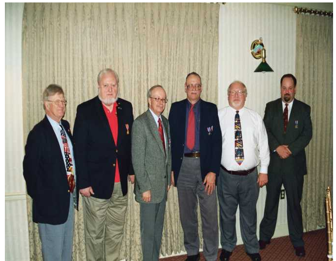
PAST CAMP 15 COMMANDERS PRESENT ALONG WITH COMMANDER-ELECT FOR 2008-09.