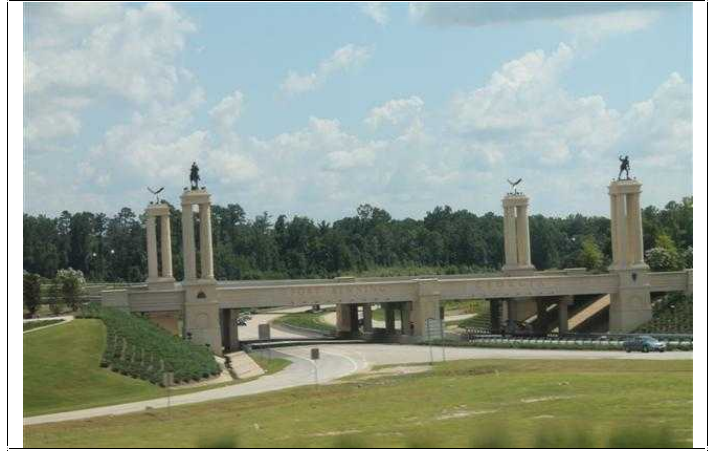
HIGHWAY EXIT TO FORT BENNING, COLUMBUS, GEORGIA

Please submit your visit, story, photos, and text to Hartranft Herald . Or perhaps you have an old story from an old Banner, Times, Post, Glamour, Live and Life , you would like to share!