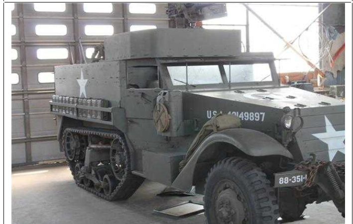
WWII HALF-TRACK, AT ARMOR MUSEUM, WAITING TO BE REFURBISHED ALONG WITH MANY OTHER VEHICLES.