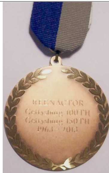
REENACTOR GETTYSBURG 100TH GETTYSBURG 150TH 1963-2013.