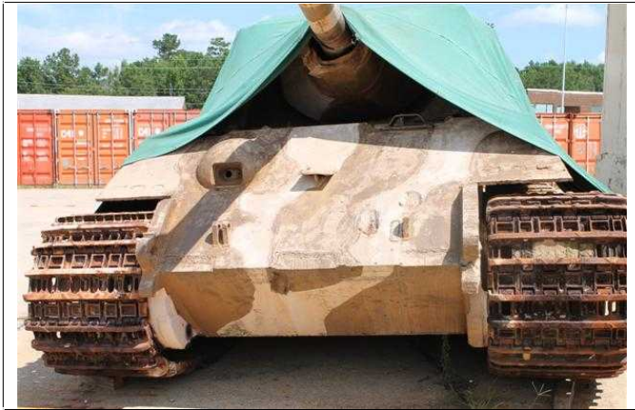
SHOWN ARE DIRECT HITS BY US FORCES UPON THIS AXIS TANK. EIGHTY-TWO .50 CAL. INDENTIONS ARE VISIBLE.

THE 2014 REUNION WILL BE HELD NEAR FT CAMPBELL; WHILE THE 2014 SUVCW ENCAMPMENT WILL BE NEAR ATLANTA, GEORGIA. WHO IS FOLLOWING WHOM?