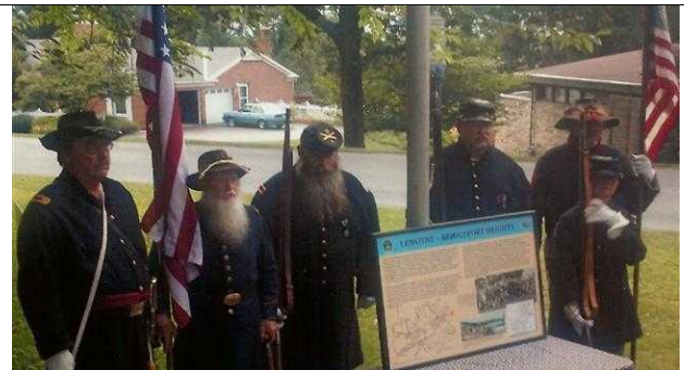
HONOR GUARD FOR UNVEILING OF A CIVIL WAR MARKER TO BE PLACED IN LEMOYNE, PA NEAR NEGLEY PARK – THE HONOR GUARD ARE MEMBERS OF 1ST PA LIGHT ARTILLERY, COOPER'S BATTERY B.