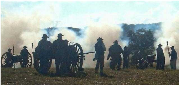
FIRING MISSION, 1ST PA LIGHT ARTILLERY, COOPER'S BATTERY B, AND CELEBRATION OF 150 TH CIVIL WAR EVENTS AT GETTYSBURG 2013.