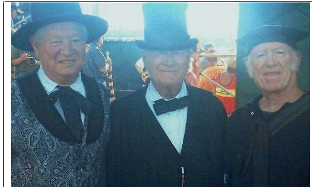
INDIVIDUALS AWARDED ACKNOWLEDGMENT FOR 50 YEARS OF SERVICE TO THE CIVIL WAR COMMUNITY AS RE-ENACTORS – LIVING HISTORIANS!