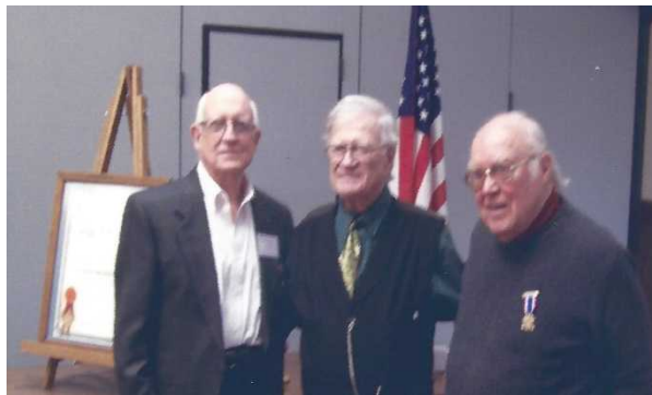
From left Vermont War Governor Holbrook, Pennsylvania War Governor Curtin and Benjamin Franklin.