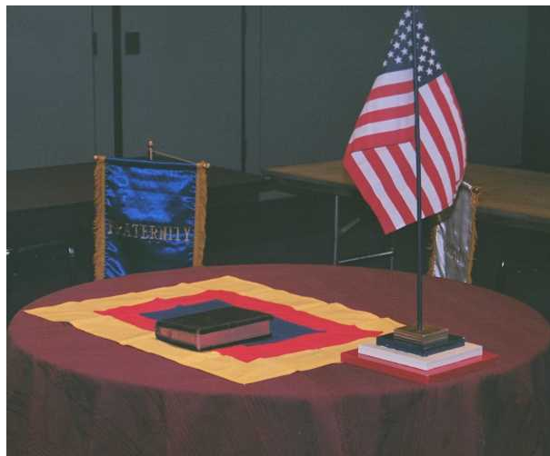
TYPICAL VIEW OF ALTAR PREPARED FOR RITUAL DURING ROUTINE CAMP 15 BUSINESS MEETING.

Past monthly newsletters are available at our camp website, http://www.geocities.com/hartranft15/index.html